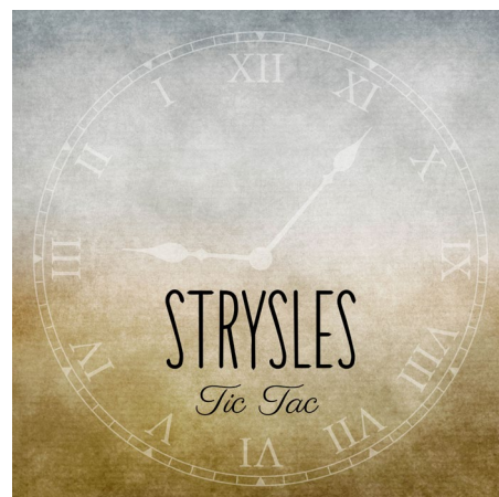
The first EP was released in April 2016