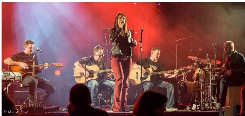
Unplugged at Musicfest 2017